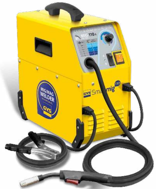
Supplied with an earth cable and a 2.2m fix torch.

1 process: NO GAZ for outdoor welding. Ø Wire 0,9 mm (kit no gas : 041240)